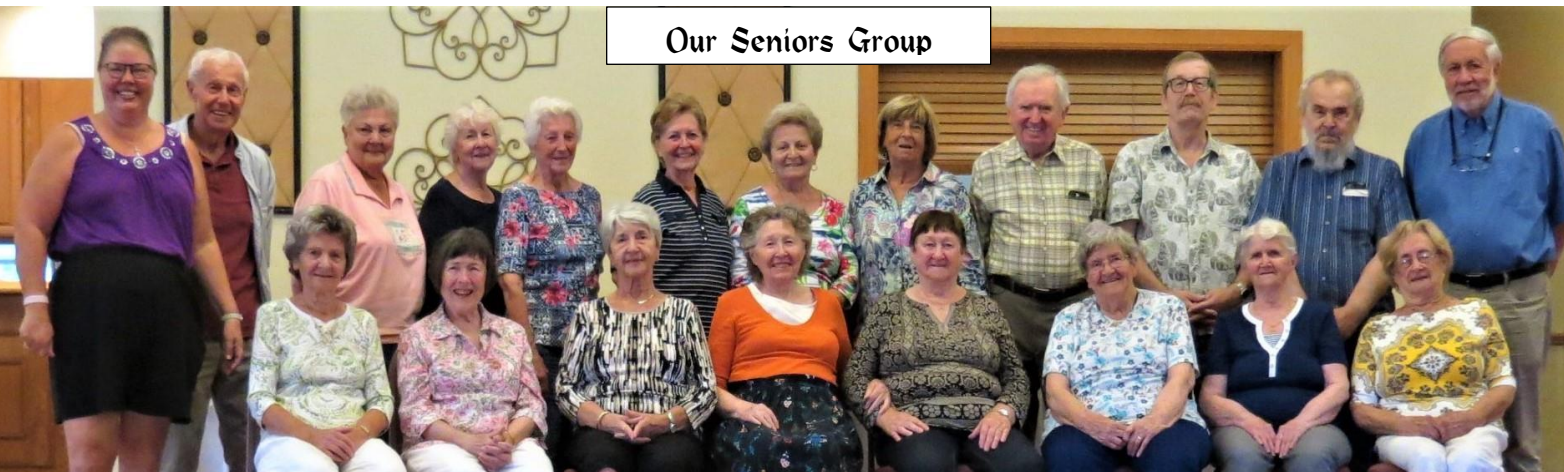
Our Seniors Group