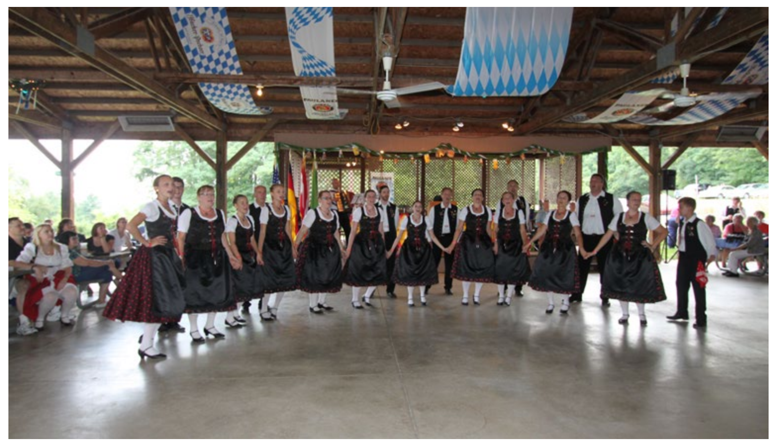
The Speyer Dance Group performing at Donauschwaben Day