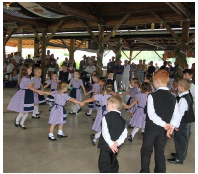
The Kleine Kinder Group performing at our annual Donauschwaben Day.

In addition to the performances by the local dance groups, 22 members from the Donaudeutsche Trachtengruppe of Speyer Germany were in there to perform a show that was over two hours long.