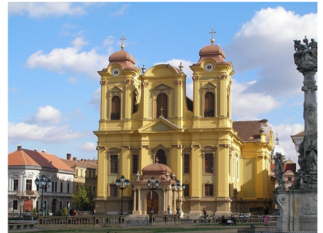
St. George's Cathedral in Temeswar

Today, Temeswar (now known as Timișoara) is – like the rest of Romania – attempting to make its way back from the dark days of war and communism. Its population of over 303,708 inhabitants makes it the third largest city in Romania, and it is the main social, economic, and cultural center in the western part of Romania. Sadly, though, the culture of Temeswar will never be as rich as it was in the days when the Donauschwaben called it home.